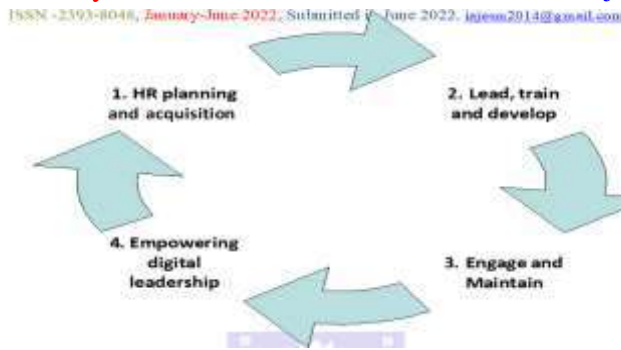
Fig.1.3. Talent Lifecycle

1. Manpower Planning and Acquisition: attracting the best talent has to do with creating the right talent that is competitive in the right job. There is very little digital talent and organizations often do not find the skills they need on the job market. However, the recruitment process must use innovative solutions to show organizations as digital brands(12).