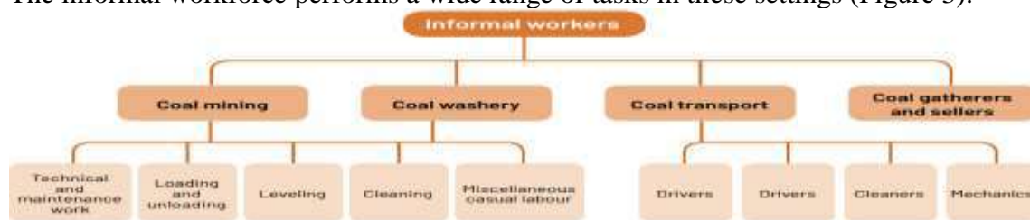
Fig. 3: Engagement of Informal Workers in the Coal Regions

Based on the evaluation, four main categories of informal worker participation in the coal economy were identified. Both the hiring of informal workers by the formal sector and the hiring of formal workers by the informal sector fall under this category. The informal coal economy consists of the two previously mentioned factors. Coal miners, coal washers, and coal transport workers are all examples of informal employees who are also active in the formal or organised sector. Coal gatherers and sellers are examples of people working in the unorganised or informal economy; they are sometimes referred to as "own account workers." The informal workforce performs a wide range of tasks in these settings (Figure 3).