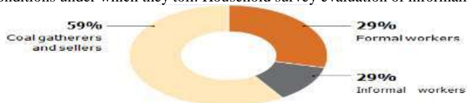
Figure 1: Proportion of formal and Informal workers in Ramgarh

The kind and degree of informal reliance on the coal sector in India's various coal areas varies widely. Coal's cultural and political significance in these regions' economies, as well as the specifics of mining operations, contribute to the wide range of outcomes. Based on observations made in several coal areas across the Indian states of Jharkhand, Chhattisgarh, and Odisha, this section describes the various sorts of workers in the informal coal industry and the conditions under which they toil. Household survey evaluation of informality