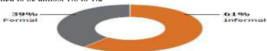
Figure 2: Proportion of formal and informal workers in Korba

According to interviews and focus groups with locals and state-level stakeholders, these problems have persisted in this coal region for over a century because of low wages, low levels of education, and a dearth of available alternatives. However, a different study conducted in the Korba area of Chhattisgarh, India's top coal producer in 2021, found different results. About 5% of homes in the district were involved in informal coal mining activities, according to a study of 600 households. This number is quite close to the percentage of households with a member with a professional coal mining job. The number of people who harvest and sell coal is extremely low. However, the coal transport industry, which is directly linked to coal mining, was found to have high instances of informality in Korba. According to the research, at least 15,300 individuals in the district are directly dependent on coal mining jobs in coal transportation (by road). Most of them (about 90%) are spoken in a casual manner. Also, while the number of people employed in transporting coal is 15% lower than the official employment in places where coal is mined. However, this doesn't account for indirect causes of reliance. Overall, the informal to formal reliance ratio in Korba was determined to be almost 1.6 to 1.2